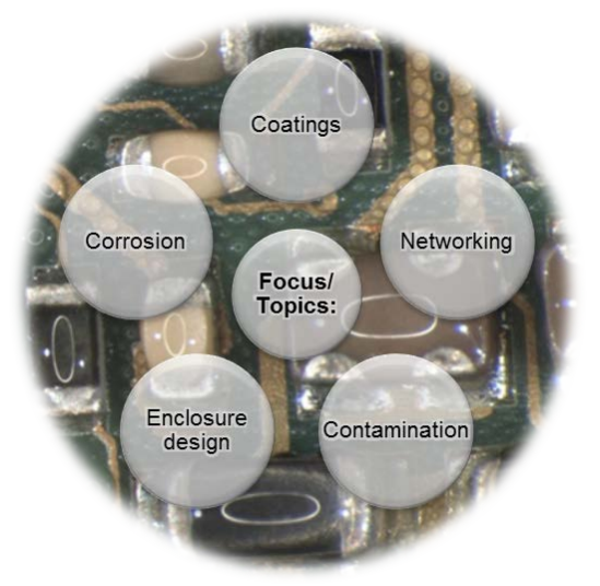
28th January 2016

Technical University of Denmark DK 2800 Kgs. Lyngby, Denmark DK 2800 Kgs. Lyngby, Denmark, Building 101, Room S09